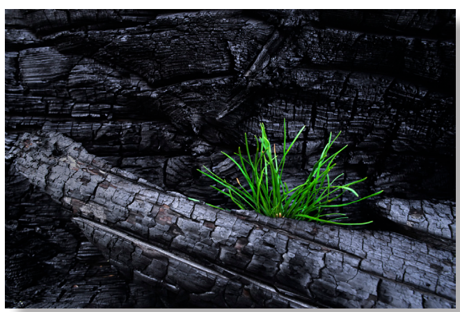
...and creates conditions for new growth.

People have been working very hard for many years to prevent human-caused forest fires. When forest fires begin, the Government of Alberta springs into action, investing time and effort into fighting forest fires as quickly as possible. There are even people whose job it is to watch the forest. From the towers where they live they keep their eye on the forest. Any sign of natural or human-caused forest fire is reported immediately, and an attack force goes to work.