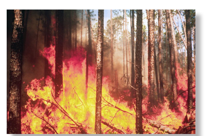
Part of the natural forest cycle, fire destroys old, vulnerable trees...

Each year about 60% of the forest fires that burn Alberta's forests are caused by nature such as lightning hitting trees. Humans, usually acting irresponsibly, cause the other 40%.